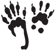
Squirrel 1 1/2" - 2 1/4"