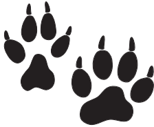
Dog 2 1/4" - 4"